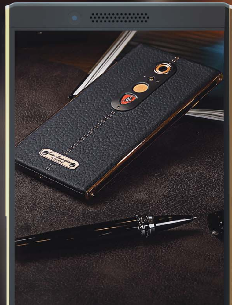
Image stabilization technology

ALPHA-ONE's camera technology allows even novices to take professional-grade photos.